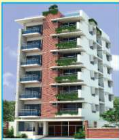
DOLONCHAPA Johuri Moholla