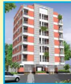
ROSE GARDEN Madrasha Road