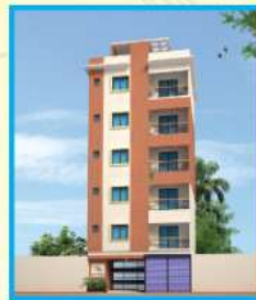
SUFIA VILLA Tikka Para