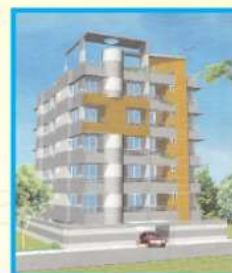
TULIP-2 Baitul Aman Housing