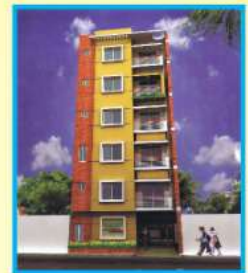
SOUTH GARDEN MIRPUR-1