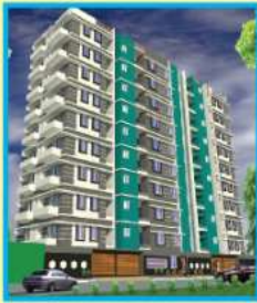
TULIP Kallyanpur (Rd #1)