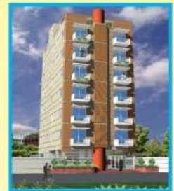
AYESHA HABIB PALACE Sekhertek, Mohammadpur