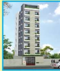
SOUTH VIEW Tajmahal Road