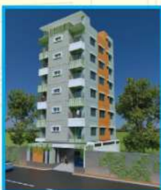
TAHMINA PALACE Kallyanpur (Rd #1)