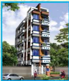
VILLA DE SHAHID West Dhanmondi