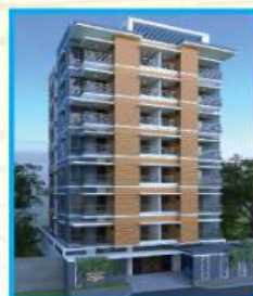
RAJANIGANDHA Sekhertek, Mohammadpur