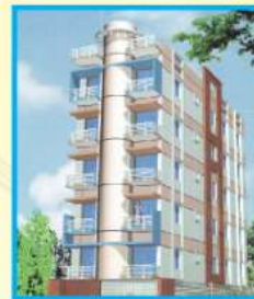
GREEN HOUSE Ullon, Rampura