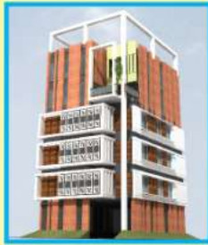
SHANTI SADAN Bashundhara (R/A)