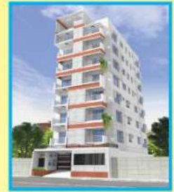
FATHER'S DREAM Tajmahal Road