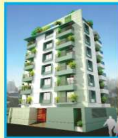
ORCHID Babar Road